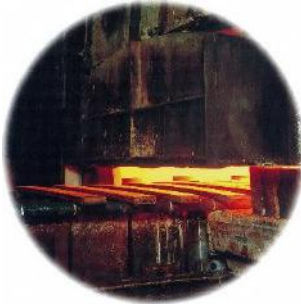
Water Quenching Equipment▽