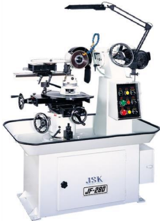
▽JSK TCT Circular Saw Grinding Machine